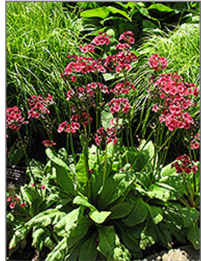
Miller's Crimson Primrose in bloom