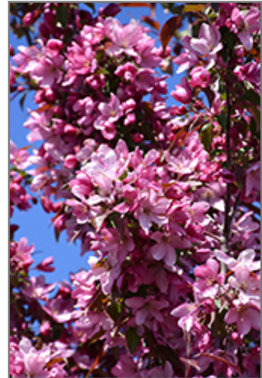
Pink Spires Flowering Crab flowers