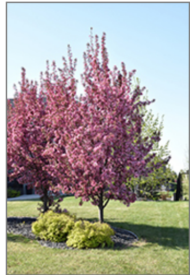
Pink Spires Flowering Crab in bloom

Pink Spires Flowering Crab is recommended for the following landscape applications;