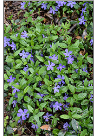
Common Periwinkle flowers