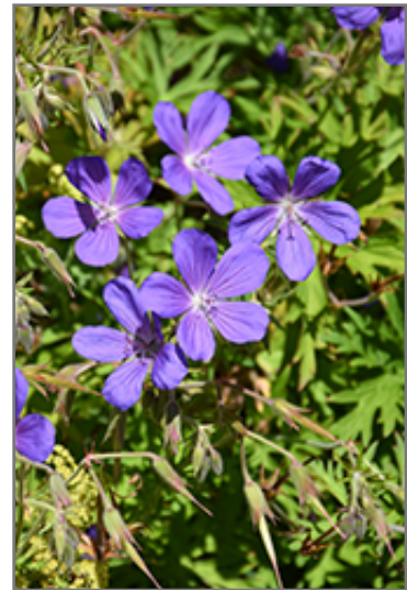
Orion Cranesbill flowers