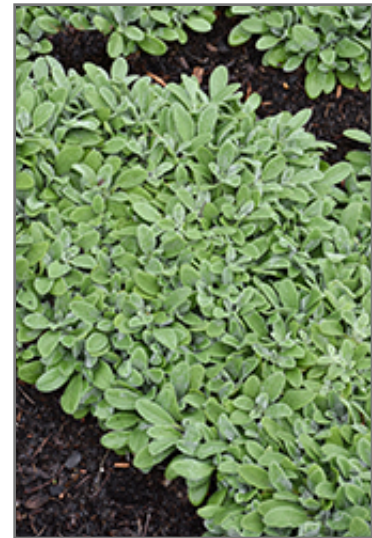
Little Lamb Lamb's Ears

This plant is not reliably hardy in our region, and certain restrictions may apply; contact the store for more information.