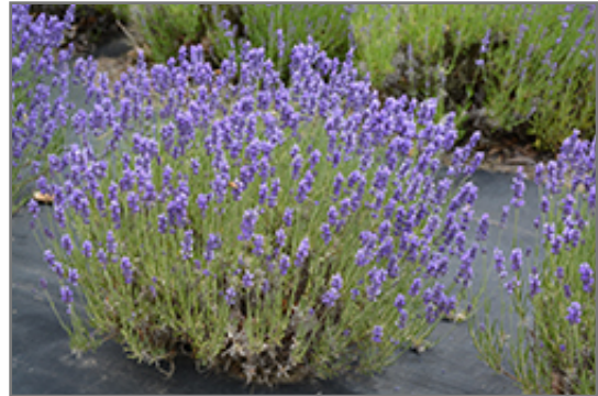
Hidcote Lavender in bloom