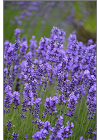
Hidcote Lavender flowers