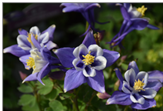
Earlybird Blue and White Columbine flowers