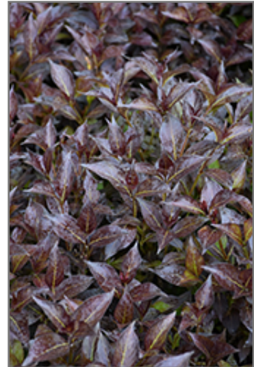
Midnight Wine Shine Weigela foliage