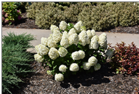
Little Lime Punch Hydrangea in bloom

Little Lime Punch Hydrangea makes a fine choice for the outdoor landscape, but it is also well-suited for use in outdoor pots and containers. With its upright habit of growth, it is best suited for use as a 'thriller' in the 'spiller-thriller-filler' container combination; plant it near the center of the pot, surrounded by smaller plants and those that spill over the edges. It is even sizeable enough that it can be grown alone in a suitable container. Note that when grown in a container, it may not perform exactly as indicated on the tag - this is to be expected. Also note that when growing plants in outdoor containers and baskets, they may require more frequent waterings than they would in the yard or garden. Be aware that in our climate, most plants cannot be expected to survive the winter if left in containers outdoors, and this plant is no exception. Contact our experts for more information on how to protect it over the winter months.