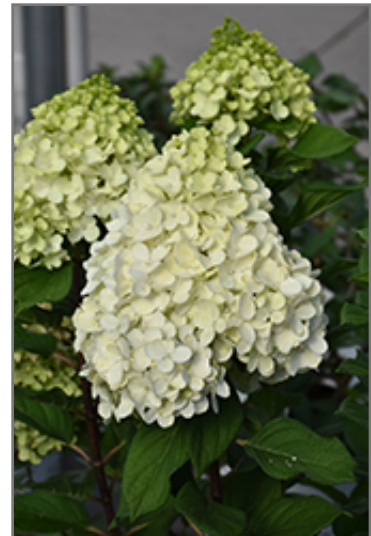
Little Lime Punch Hydrangea flowers