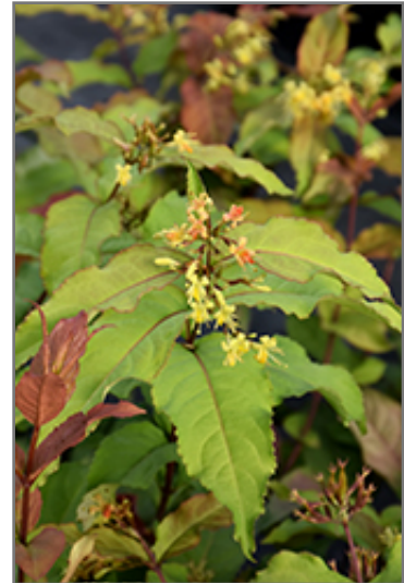
Kodiak Fresh Diervilla flowers