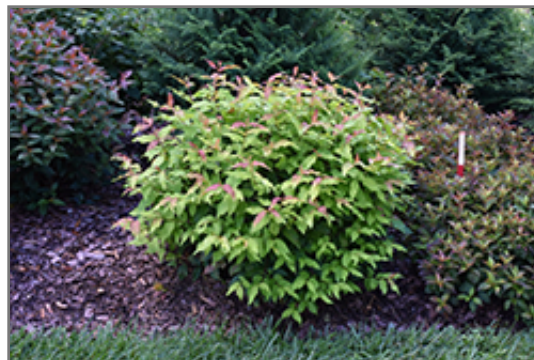
Kodiak Fresh Diervilla

Kodiak Fresh Diervilla makes a fine choice for the outdoor landscape, but it is also well-suited for use in outdoor pots and containers. Because of its height, it is often used as a 'thriller' in the 'spiller-thriller-filler' container combination; plant it near the center of the pot, surrounded by smaller plants and those that spill over the edges. It is even sizeable enough that it can be grown alone in a suitable container. Note that when grown in a container, it may not perform exactly as indicated on the tag - this is to be expected. Also note that when growing plants in outdoor containers and baskets, they may require more frequent waterings than they would in the yard or garden. Be aware that in our climate, most plants cannot be expected to survive the winter if left in containers outdoors, and this plant is no exception. Contact our experts for more information on how to protect it over the winter months.