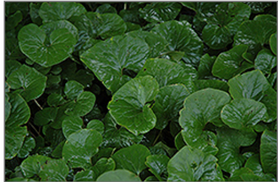
Canadian Wild Ginger