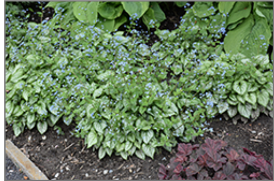
Jack Frost Bugloss in bloom

Jack Frost Bugloss will grow to be about 12 inches tall at maturity extending to 16 inches tall with the flowers, with a spread of 18 inches. When grown in masses or used as a bedding plant, individual plants should be spaced approximately 14 inches apart. It grows at a medium rate, and under ideal conditions can be expected to live for approximately 10 years. As an herbaceous perennial, this plant will usually die back to the crown each winter, and will regrow from the base each spring. Be careful not to disturb the crown in late winter when it may not be readily seen!