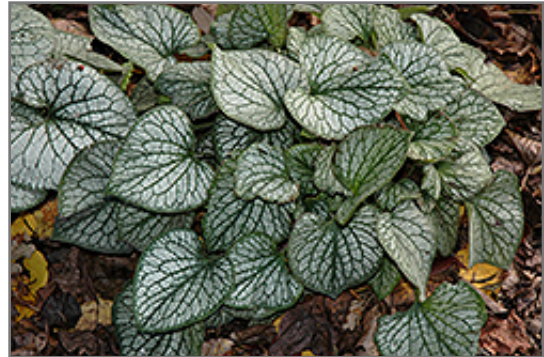
Jack Frost Bugloss foliage