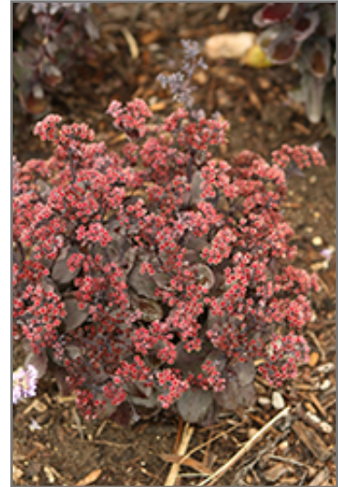
Rock 'N Grow Back in Black Stonecrop flowers

This plant is not reliably hardy in our region, and certain restrictions may apply; contact the store for more information.