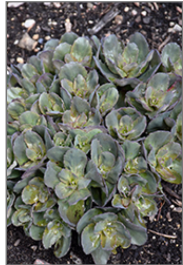
Rock 'N Grow Back in Black Stonecrop foliage