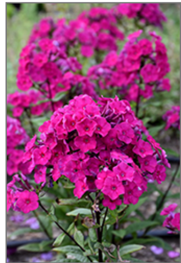
Super Ka-Pow Fuchsia Garden Phlox flowers