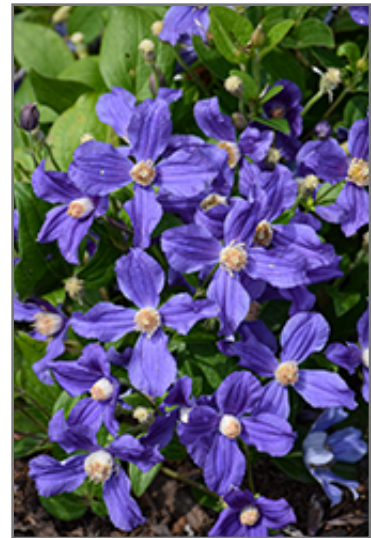
Rain Dance Clematis flowers