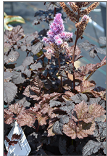
Dark Side Of The Moon Astilbe in bloom

Dark Side Of The Moon Astilbe is a fine choice for the garden, but it is also a good selection for planting in outdoor pots and containers. With its upright habit of growth, it is best suited for use as a 'thriller' in the 'spiller-thriller-filler' container combination; plant it near the center of the pot, surrounded by smaller plants and those that spill over the edges. Note that when growing plants in outdoor containers and baskets, they may require more frequent waterings than they would in the yard or garden. Be aware that in our climate, most plants cannot be expected to survive the winter if left in containers outdoors, and this plant is no exception. Contact our experts for more information on how to protect it over the winter months.