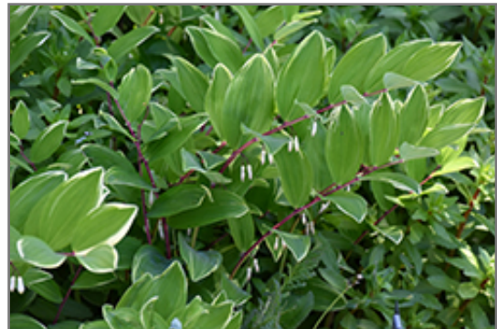
Variegated Solomon's Seal flowers