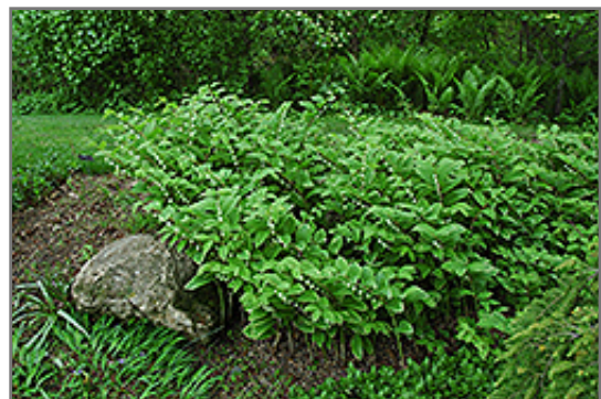
Variegated Solomon's Seal in bloom