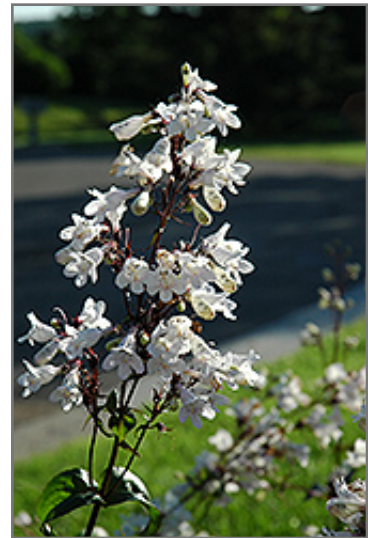
Husker Red Beard Tongue flowers