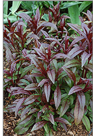
Husker Red Beard Tongue foliage