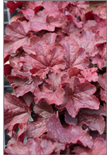
Northern Exposure Red Coral Bells foliage

Northern Exposure Red Coral Bells is recommended for the following landscape applications;