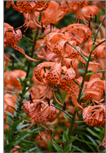
Tiger Lily flowers