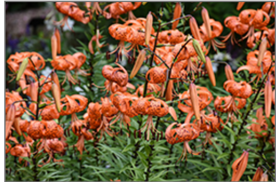
Tiger Lily flowers