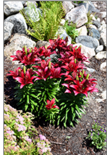
Lily Looks Tiny Rocket Lily in bloom