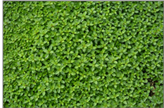
Creeping Thyme foliage