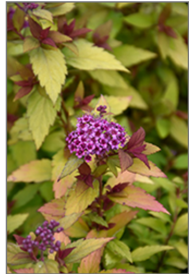
Poprocks Rainbow Fizz Spirea flowers