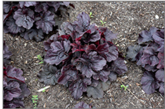
Northern Exposure Black Coral Bells