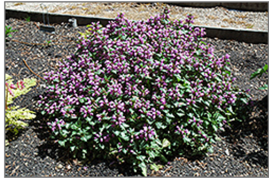
Beacon Silver Spotted Dead Nettle in bloom