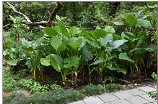
Calidora Elephant's Ear

This plant should be grown in a location with partial shade or which is shaded from the hot afternoon sun. It is quite adaptable, preferring to grow in average to wet conditions, and will even tolerate some standing water. It is not particular as to soil pH, but grows best in rich soils. It is somewhat tolerant of urban pollution. This particular variety is an interspecific hybrid, and parts of it are known to be toxic to humans and animals, so care should be exercised in planting it around children and pets.