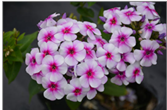
Ka-Pow White Bicolor Garden Phlox flowers

Ka-Pow White Bicolor Garden Phlox is recommended for the following landscape applications;