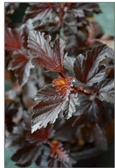
Fireside Ninebark flowers