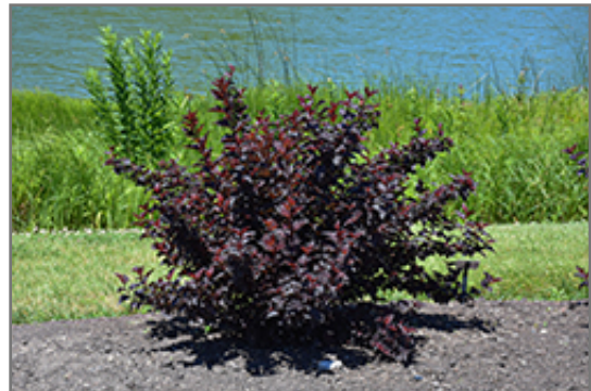
Fireside Ninebark

Fireside Ninebark is recommended for the following landscape applications;