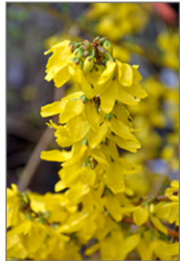
Magical Gold Forsythia flowers

This plant is not reliably hardy in our region, and certain restrictions may apply; contact the store for more information.