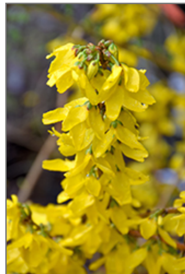
Magical Gold Forsythia flowers

This plant is not reliably hardy in our region, and certain restrictions may apply; contact the store for more information.