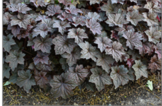
Palace Purple Coral Bells

Palace Purple Coral Bells will grow to be about 12 inches tall at maturity extending to 24 inches tall with the flowers, with a spread of 12 inches. When grown in masses or used as a bedding plant, individual plants should be spaced approximately 10 inches apart. Its foliage tends to remain dense right to the ground, not requiring facer plants in front. It grows at a medium rate, and under ideal conditions can be expected to live for approximately 10 years. As an evergreen perennial, this plant will typically keep its form and foliage year-round.