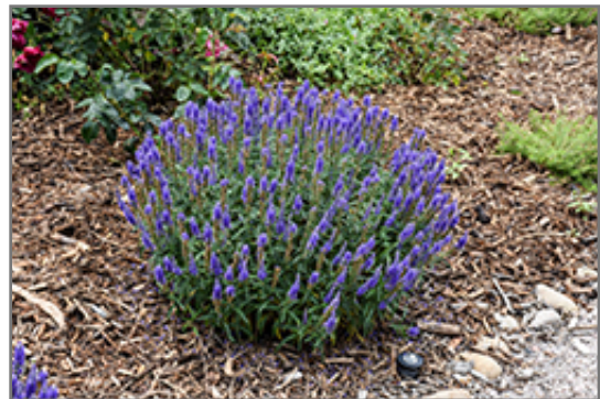
Moody Blues Dark Blue Speedwell in bloom