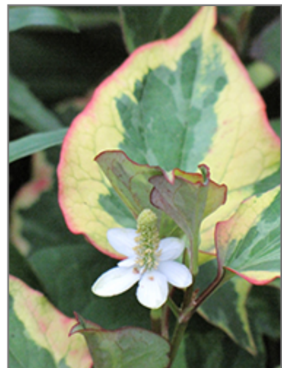
Chameleon Houttuynia flowers