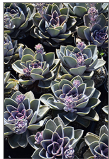
Perle Von Nurnberg Echeveria