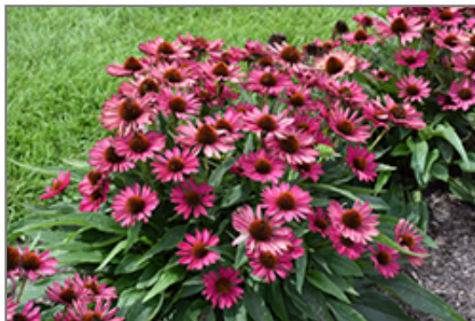
Kismet Raspberry Coneflower in bloom

Kismet Raspberry Coneflower will grow to be about 16 inches tall at maturity, with a spread of 24 inches. Its foliage tends to remain dense right to the ground, not requiring facer plants in front. It grows at a fast rate, and under ideal conditions can be expected to live for approximately 10 years. As an herbaceous perennial, this plant will usually die back to the crown each winter, and will regrow from the base each spring. Be careful not to disturb the crown in late winter when it may not be readily seen!