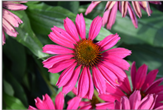
Kismet Raspberry Coneflower flowers