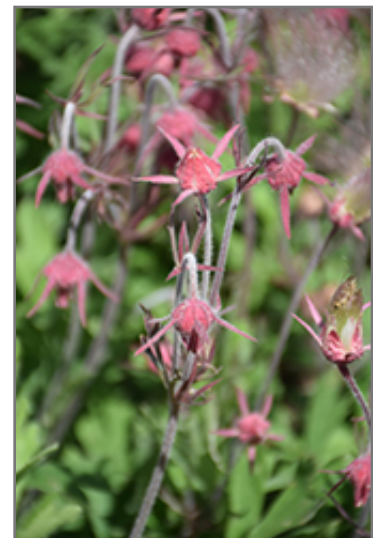
Prairie Smoke flower buds