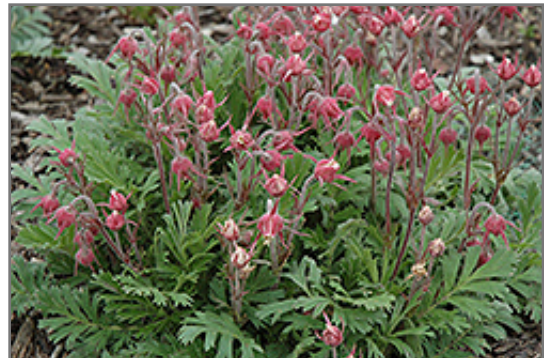
Prairie Smoke in bloom

This plant will require occasional maintenance and upkeep, and should be cut back in late fall in preparation for winter. It is a good choice for attracting butterflies to your yard, but is not particularly attractive to deer who tend to leave it alone in favor of tastier treats. Gardeners should be aware of the following characteristic(s) that may warrant special consideration;