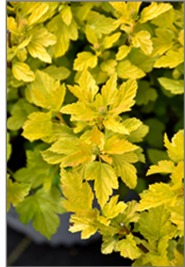
Tiny Wine Gold Ninebark foliage

Tiny Wine Gold Ninebark is recommended for the following landscape applications;