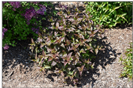
Kodiak Black Diervilla