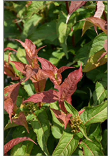
Kodiak Orange Diervilla foliage

Kodiak Orange Diervilla is recommended for the following landscape applications;