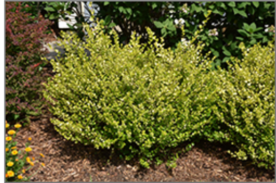
Cesky Gold Dwarf Birch