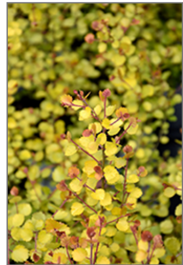
Cesky Gold Dwarf Birch foliage