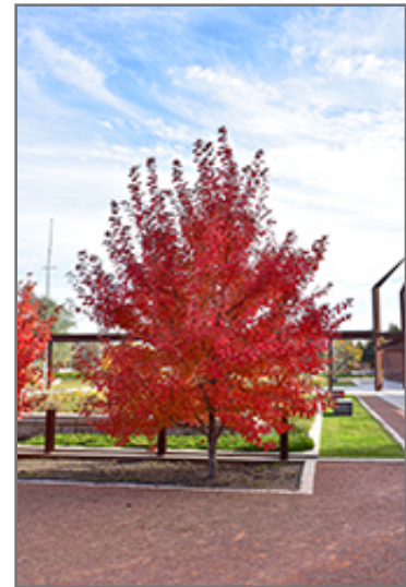
Regal Celebration Maple in fall