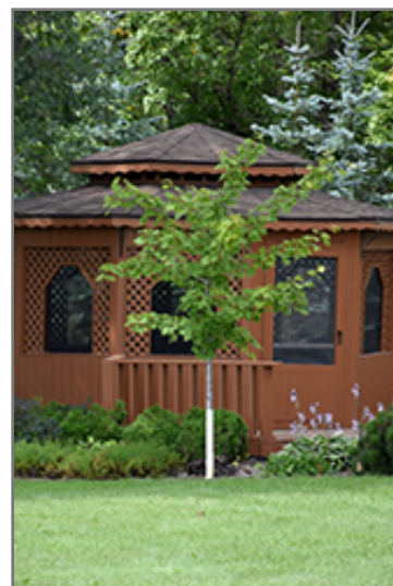
Regal Celebration Maple

This plant is not reliably hardy in our region, and certain restrictions may apply; contact the store for more information.