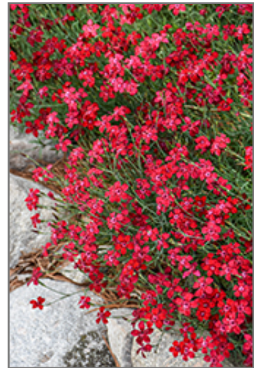
Flashing Light Maiden Pinks flowers

Flashing Light Maiden Pinks is recommended for the following landscape applications;