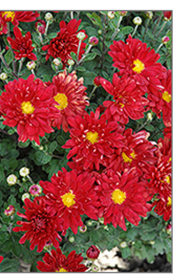
Firestorm Chrysanthemum flowers