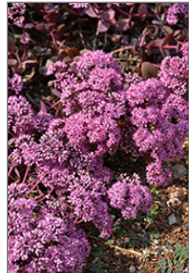
Cherry Tart Stonecrop flowers

This plant is not reliably hardy in our region, and certain restrictions may apply; contact the store for more information.