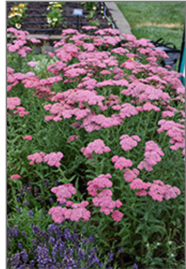
New Vintage Rose Yarrow in bloom