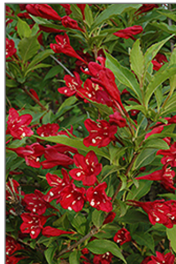
Red Prince Weigela flowers