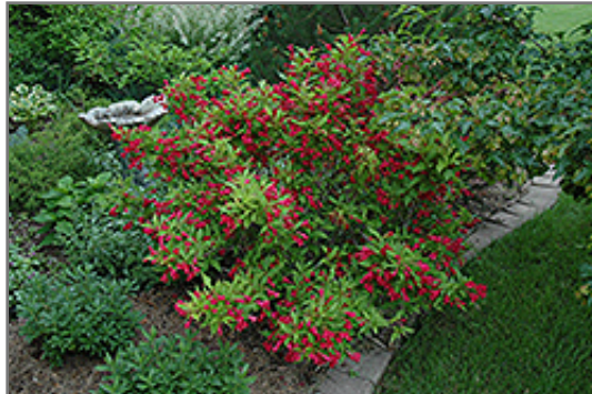
Red Prince Weigela in bloom