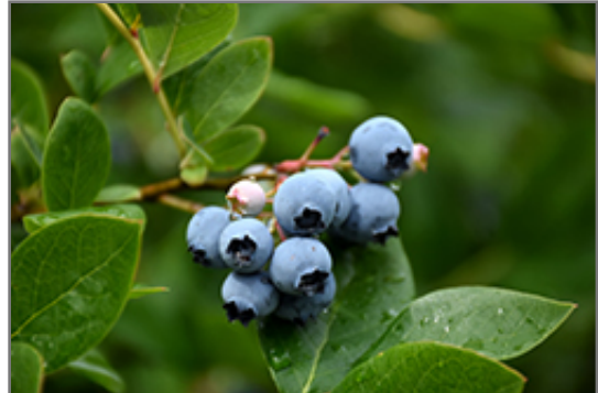
Northcountry Blueberry fruit

Northcountry Blueberry features dainty clusters of white bell-shaped flowers with shell pink overtones hanging below the branches in mid spring. It has green deciduous foliage. The glossy oval leaves turn an outstanding scarlet in the fall. It features an abundance of magnificent blue berries in mid summer.