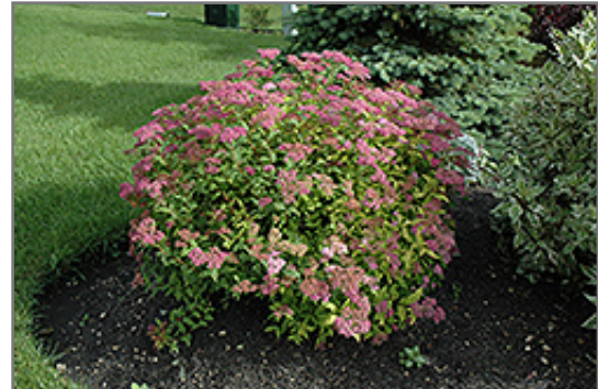
Goldflame Spirea in bloom