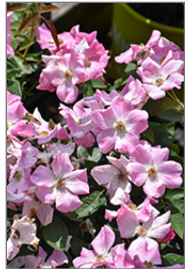
Nearly Wild Rose flowers