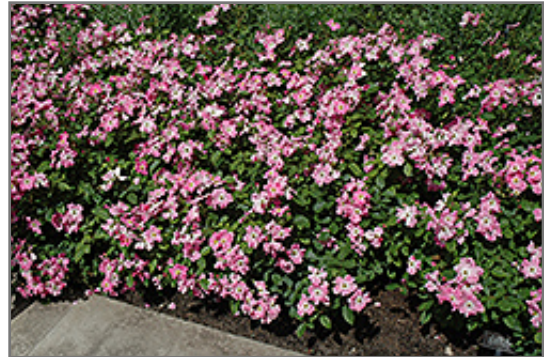
Nearly Wild Rose in bloom