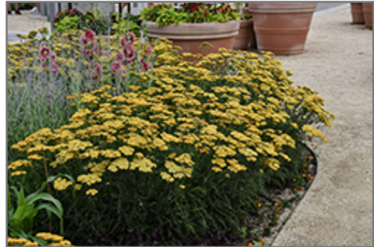
Terra Cotta Yarrow in bloom