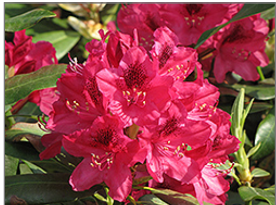
Nova Zembla Rhododendron flowers